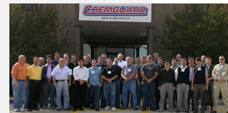
Class of 2008

Exit the Airport, take a right onto Mockingbird Lane to I-35E South towards Waco (approximately 12 miles). Take the Hwy 67 split and continue until you reach I-20. Take I-20 Westbound toward Ft. Worth. Continue on I-20 Westbound approximately 7 miles until you reach Hwy 360. Take Hwy 360 Southbound. Continue on HWY 360S to Mansfield. Take a right onto E. Broad St. headed westbound. Continue down E. Broad St. until you cross over US Hwy 287. Turn right and head North ¼ mile on the Southbound feeder road, the hotel is on the left.